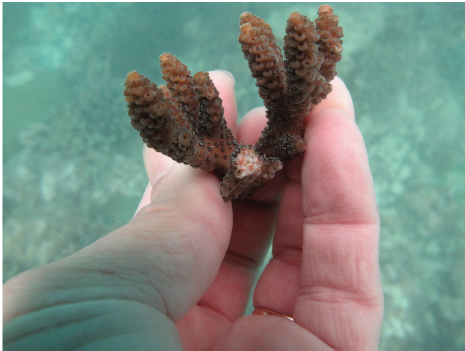
Figure 2. Mature (colored) oocytes are clearly visible in the branches of Acropora colonies.